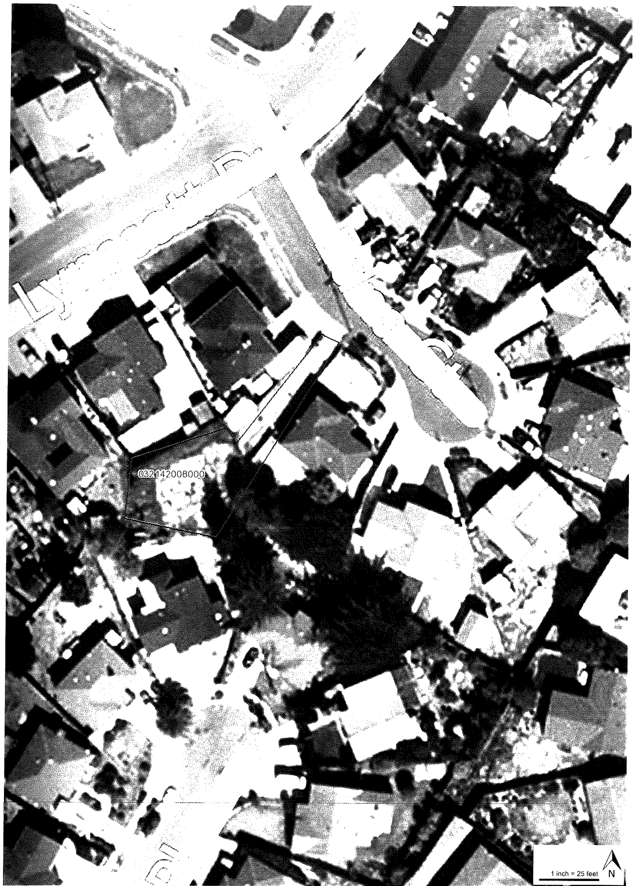
Exhibit "A" Page 3 of 3 DACA05-8-14-0103 Marina Coast Water District